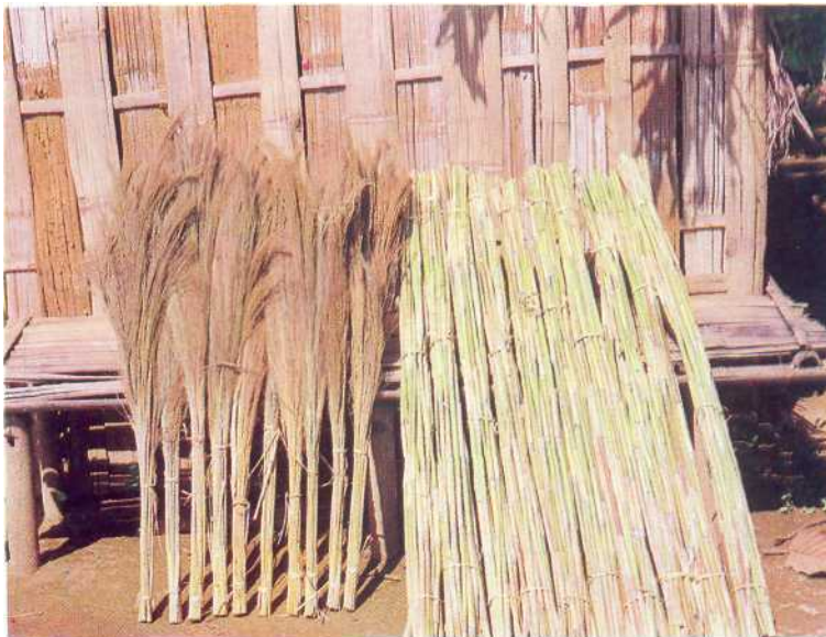
Broom and stem cuttings (used for house construction)