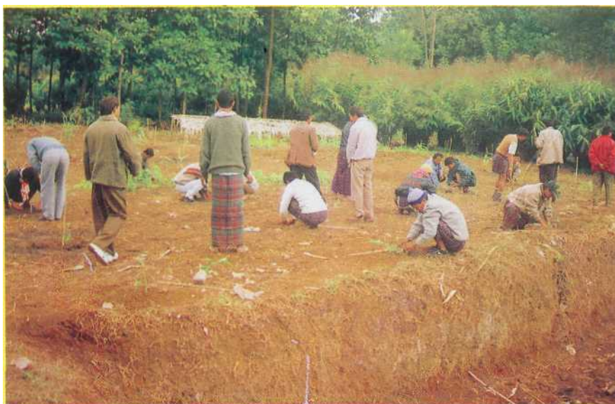
Planting of broom-grass by trainees at Lathow, Namsai