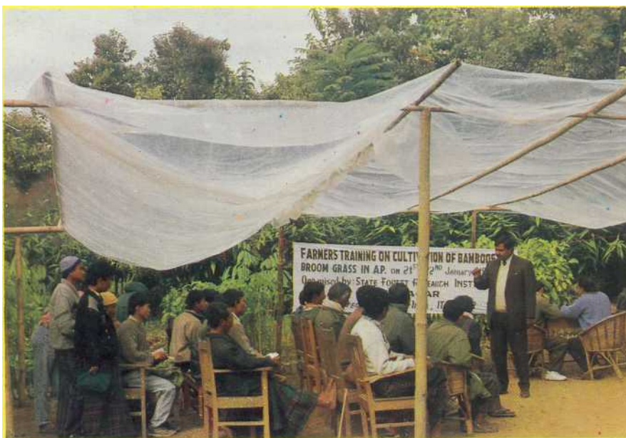
Training of local farmers at Namsai