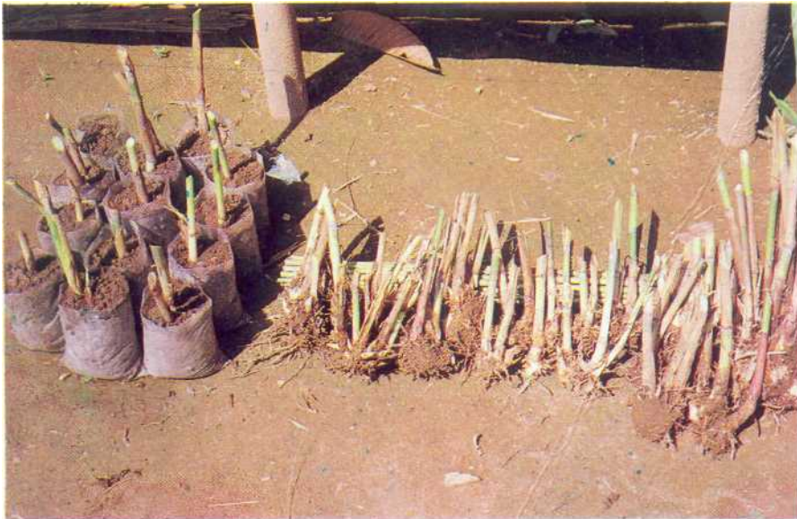
Rhizome cuttings in polythene bags, and rhizome - cuttings ready for plantation