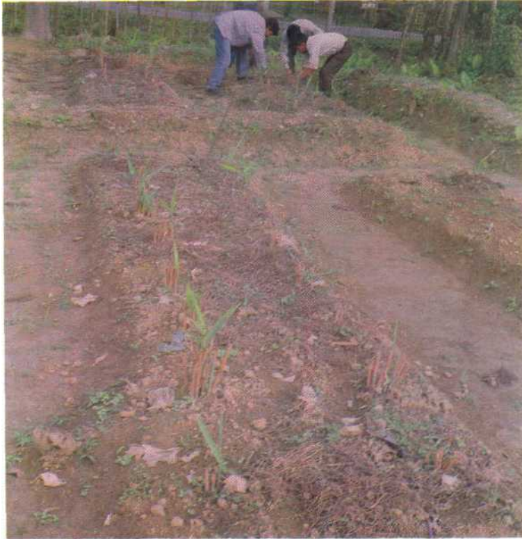
Sprouting of rhizome cuttings in nursery beds at Namsai