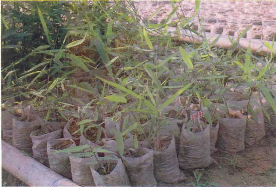
Polybag seedlings of broom-grass